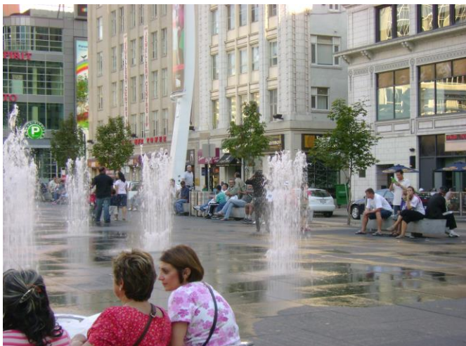
Summer life in Toronto

Most people in Ontario speak English, but the province also has the largest French-Speaking population outside of Quebec.